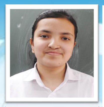
First Position in Science Quiz