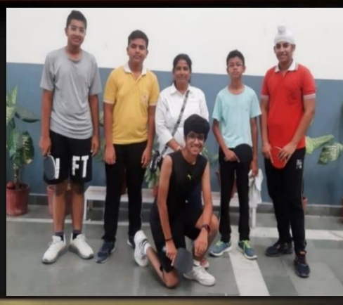
Team Under - 14 Year Category